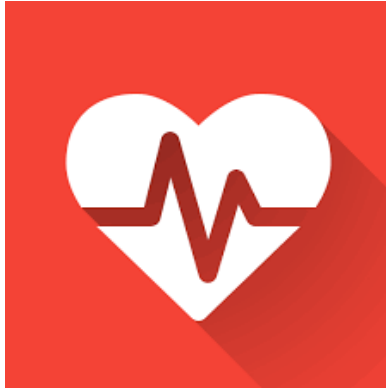
ICE In Case of Emergency