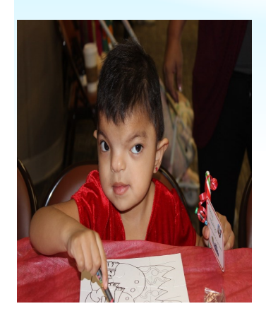
ACRC Santa Day, 2015

"Respite is a break that keeps families from breaking."