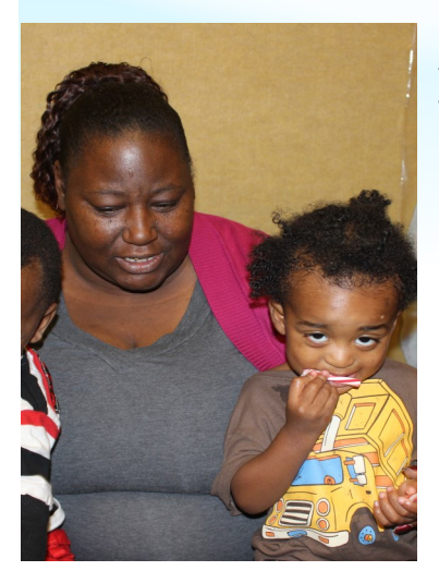
ACRC Santa Day 2014